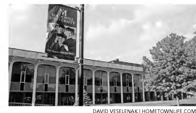
Madonna University is reaching out to Marygrove College students after the Detroit school announced it would close its undergraduate program.

"They were giving us some forewarning that